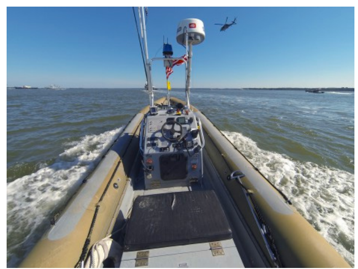
The boat swarm.

ground vehicles, preventing air-to-air collisions among UAVs, and explore the long-term development of machine intelligence and decisionmaking. (Program Element 0603941D8Z)