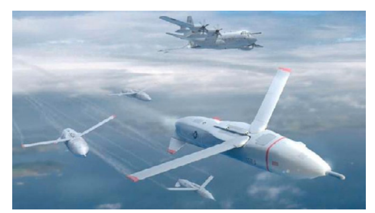
The Gremlins concept.

also seeks to overcome the challenges posed by controlling large maritime areas. The goal of this project is to develop a network of different types of undersea vehicles that could, when awakened, carry out a variety of missions and augment the capabilities of a manned ship. The Mobile Offboard Command Control and Attack program, allocated $16.3 million, will develop an unmanned undersea vehicle to detect enemy submarines. (Program Elements 03603766E and 0302702E)