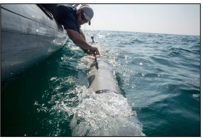
An MK18 MOD2 Unmanned Undersea Vehicle.

Year 2017. Funding for the Unmanned Surface Vehicle and the Large Displacement Unmanned Undersea Vehicle, received large boosts of 83 and 450 percent, respectively. Funding for the Remote Minehunting System is down from $17.6 million in 2016 to $3 million in 2017. (Program Elements 0603502N, 0604122N, and 0604122N)