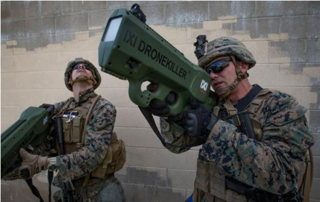
U.S. Marines test the IXI Technology Drone Killer system at the Urban Advanced Naval Technology Exercise 2018.