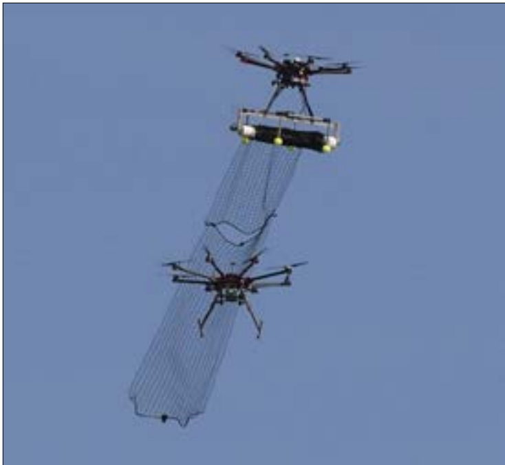
An attack drone armed with a net.