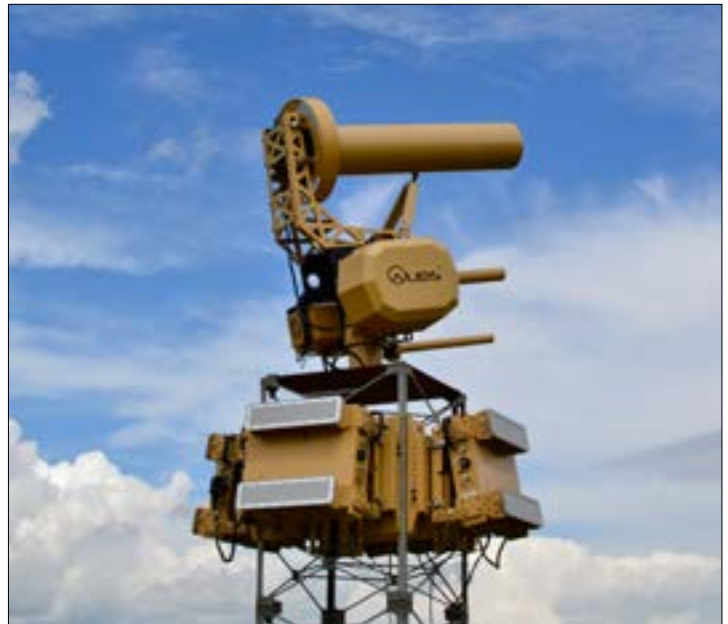
The AUDES Counter-UAS system.