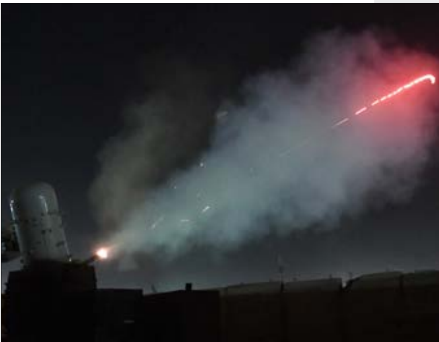
The C-RAM air defense system.

Some of the detection and interdiction elements used in new counter-drone systems are, likewise, based on existing products. For example, Babcock’s LDEW-CD system incorporates Raytheon’s Phalanx unit. A number of radar and jamming units are likewise derived from existing products, and are merely repackaged for the counter-drone mission.