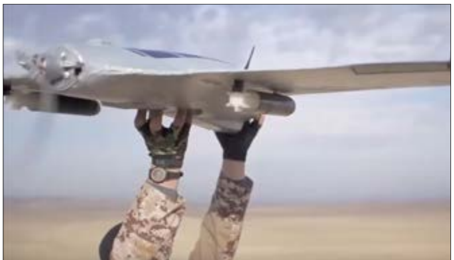
A still from an ISIS promotional video shows an armed Sky-walker X-8 fixed-wing drone.

have carried out more than 200 such attacks in just 12 months. 3 In January, an unknown group launched over a dozen such drones in a coordinated attack against two Russian military installations in Syria. 4 Though the offensive was ultimately unsuccessful, it demonstrated the growing sophistication of the unmanned aircraft that are increasingly finding their way into war zones across the globe. Even when these attacks are unsuccessful, they still create serious challenges for belligerents on the ground and in the air; there are so many drones operating in the conflict in Syria and Iraq that one Army official even said that the U.S. has no control of the airspace below 3,500 feet in the area. 5 The conflict in Ukraine is another important case study on the impact of small unmanned aircraft in modern warfare. 6