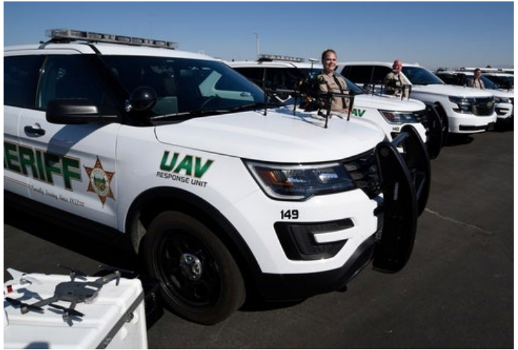
The Tulare County Sheriff’s UAV Response Unit.

*This estimate is based on either the year as reported in local media or, in the case of FAA records, the year that the department received an N-number registration, COA, or Part 107 Waiver. As a result, it is difficult to know the precise origin date for each department’s drone program.